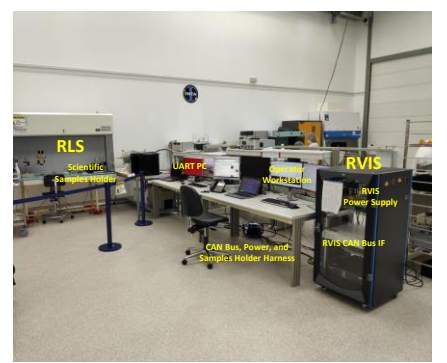
Figure 2. Testing framework inside INTA facilities